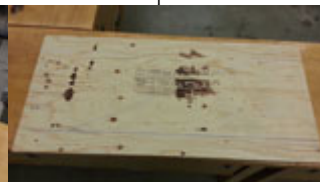
W.F. sample 7