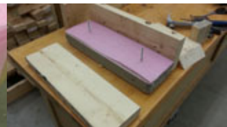
W.F. sample 4