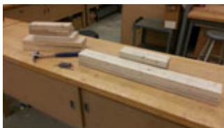
W.F. sample 19