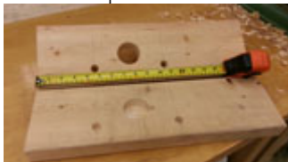
W.F. sample 17