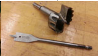
W.F. sample 18