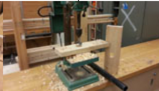
W.F. sample 15