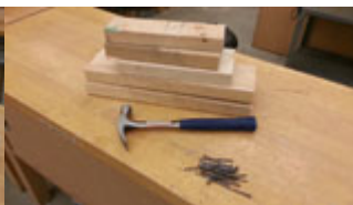
W.F. sample 20