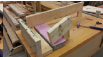
W.F. sample 12