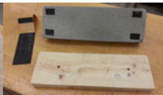
W.F. sample 2