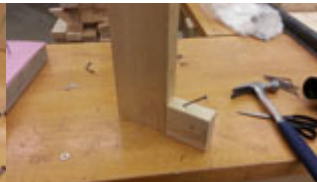
W.F. sample 11