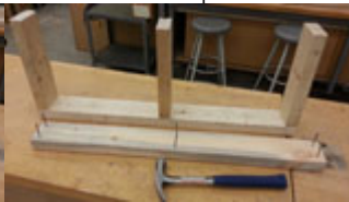
W.F. sample 24