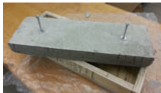
W.F. sample 1