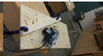
W.F. sample 8