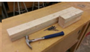
W.F. sample 21