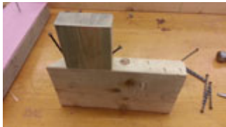
W.F. sample 9