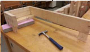
W.F. sample 14