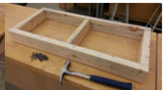
W.F. sample 22