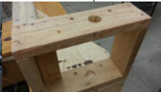
W.F. sample 28