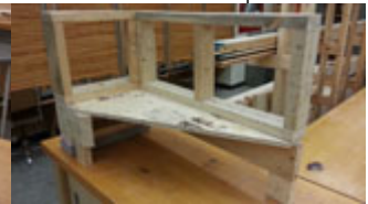
W.F. sample 26