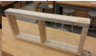
W.F. sample 25