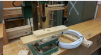
W.F. sample 16