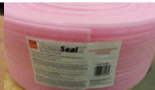
W.F. sample 3