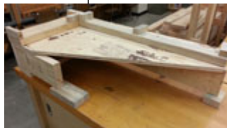
W.F. sample 5