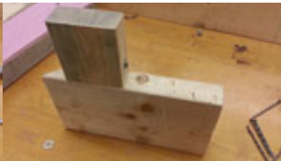
W.F. sample 10