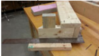
W.F. sample 13