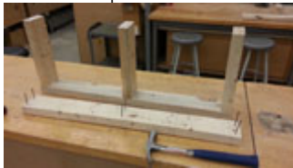
W.F. sample 23