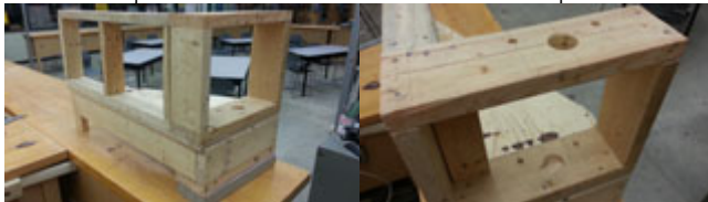
W.F. sample 27