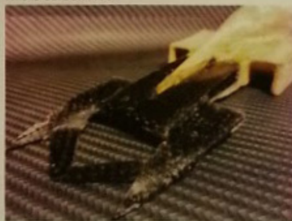
This is Carbon Fiber.