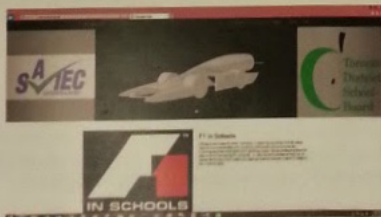
This is our website.